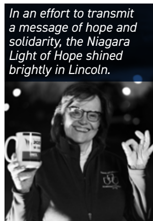
In an effort to transmit a message of hope and solidarity, the Niagara Light of Hope shined brightly in Lincoln.