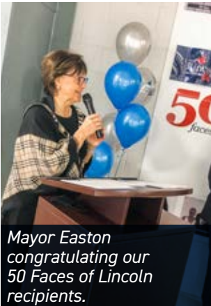
Mayor Easton congratulating our 50 Faces of Lincoln recipients.