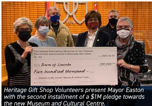
Heritage Gift Shop Volunteers present Mayor Easton with the second installment of a $1M pledge towards the new Museum and Cultural Centre.