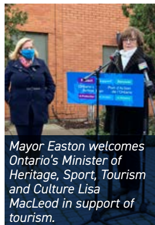
Mayor Easton welcomes Ontario's Minister of Heritage, Sport, Tourism and Culture Lisa MacLeod in support of tourism.